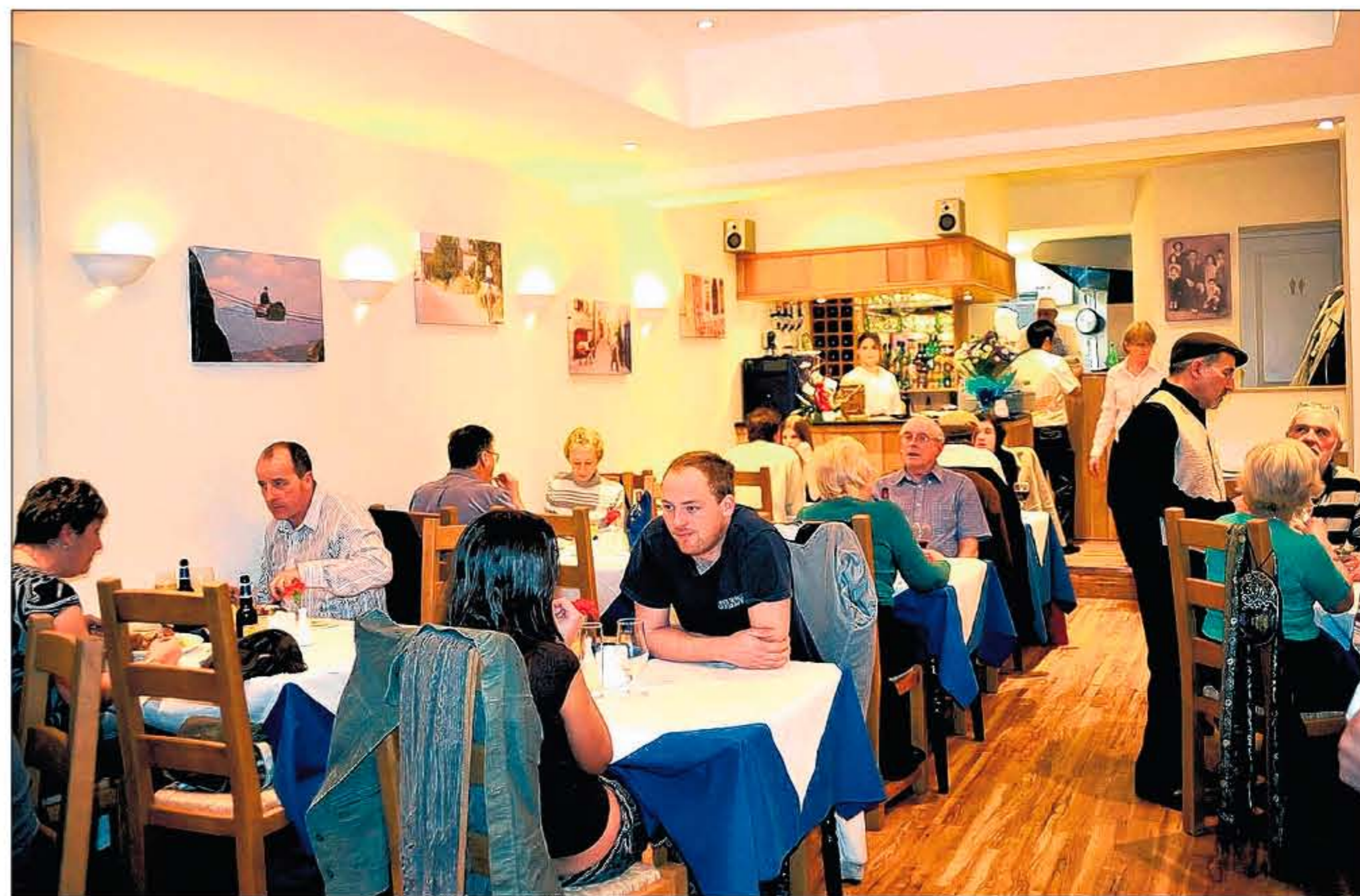
■ Stavros new Greek restaurant in Newquay.

wines and beers, makes for a fine, traditional experience. So enjoyable, you almost want to throw a plate... ● Stavros Greek Taverna will be open from noon on Sunday for Mother's Day lunches.